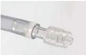
Luer Lock Connector